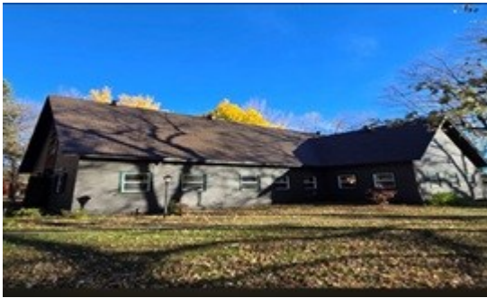
New Chapel Roof!